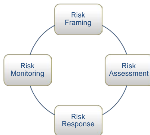
Figure 1: Risk Management Process

The phrase “commensurate with risk to critical infrastructure and organizational objectives” is used throughout the model. This phrase reminds the organization to tailor its implementation of the model content to address its unique risk profile. This supports the model intent of providing descriptive rather than prescriptive guidance. In order to effectively follow this guidance, the organization should use the model as part of a continuous enterprise risk management process like that depicted in Figure 1: Risk Management Process.