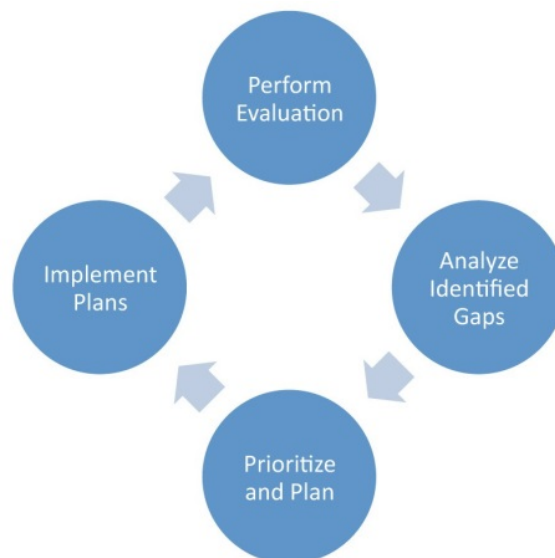
Figure 4: Recommended Approach for Using the Model

The C2M2 is meant to be used by an organization to evaluate its cybersecurity capabilities consistently, to communicate its capability levels in meaningful terms, and to inform the prioritization of its cybersecurity investments. Figure 4 summarizes the recommended approach for using the model. An organization performs an evaluation against the model, uses that evaluation to identify gaps in capability, prioritizes those gaps and develops plans to address them, and finally implements plans to address the gaps. As plans are implemented, business objectives change, and the risk environment evolves, the process is repeated. The following sections discuss the preparation activities required to begin using the model in an organization and provide additional details on the activities in each step of this approach.