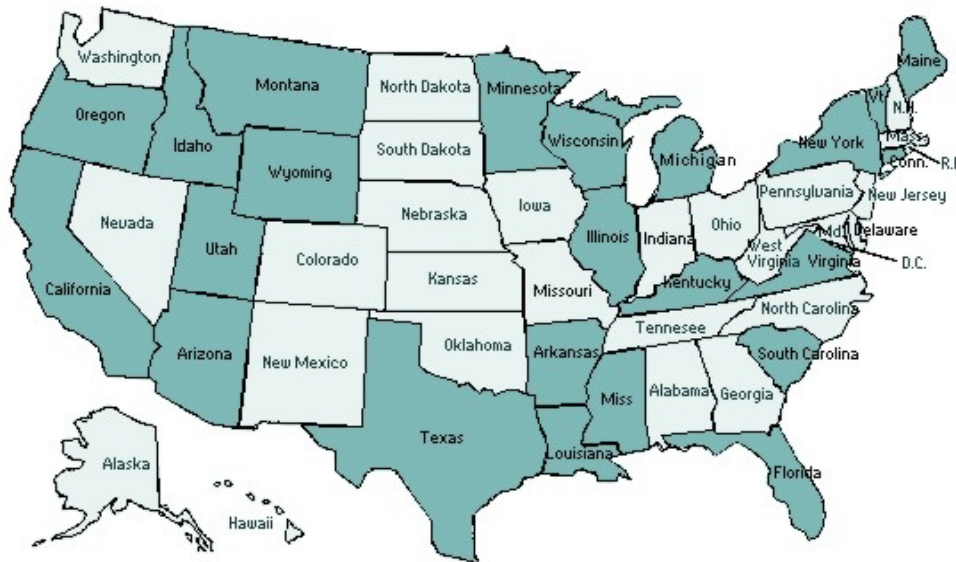
Figure 2. Diagram of Responding States (darker color shading)

Individual in-depth interviews were conducted with each selected expert who agreed to be interviewed. The interview guide was reviewed and approved by ORNL prior to implementation, and all interviews were conducted by telephone. The objective was to obtain interviews from a sample of states that represented a distribution of large states, small states, southern states, northern states, eastern states, midwestern states and western states. Accordingly, the effort targeted all states with willing respondents who were available to be interviewed within the project’s allotted time period. The study was able to obtain completed interviews from all targeted regions of the country, encompassing states having both large and small populations over a dispersed geographic area. Figure 2 below presents a diagram of the states included in the study.