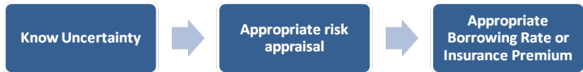
Figure 2.2.1 Understanding Uncertainty (Lynn)

Developers of new PV and concentrating PV (CPV) technologies or manufacturing methods are having difficulty achieving bankability, including companies that have established commercial-level manufacturing facilities. The RTCs will serve to validate technologies by quantifying performance of defined system scales in different U.S. regions.