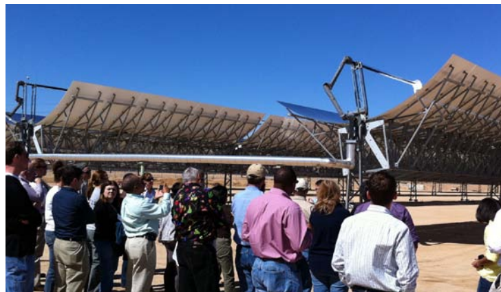
In October 2010, DOE partnered with the National Association of Regulatory Utility Commissioners to organize a day-long tour of utility-scale solar energy facilities as part of a 2-day workshop on integrating renewables onto the grid for utility regulators.

A well-trained workforce is critical to support a successful solar market. High-quality installations improve system performance at a lower cost, driving consumer demand for solar technologies. In 2009, DOE established the Solar Instructor Training Network to increase the quality, consistency, and availability of instruction