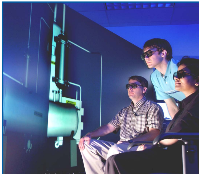
Members of the Visualization Research Group in the National Energy Technology Laboratory's Office of Research and Development develop capabilities to visualize data and advanced power generation systems.

► SPR Petroleum Account : The FY 2012 budget included a $500 million rescission of sales receipts from the 2011 drawdown. The FY 2013 budget proposes to permanently cancel $291 million of sales receipts.