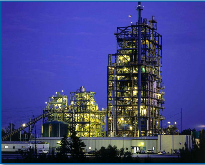
Increasing system efficiencies and reducing CCS capital costs is one focus area for FER&D.

nomically and environmentally sound manner by developing the technical capability to dramatically reduce carbon emissions to achieve near-zero atmospheric emissions power production. To achieve this goal, the program is focused on developing and demonstrating advanced power generation and carbon capture, utilization and storage technologies for existing facilities and new fossil-fueled power plants by increasing overall system efficiencies and reducing capital costs. In the near-term, advanced technologies that increase the power generation efficiency for new plants and technologies to capture carbon dioxide (CO 2 ) from new and existing industrial and power-producing plants are being developed. In the longer term, the goal is to increase energy plant efficiencies and reduce both the energy and capital costs of CO 2 capture and storage from new, advanced coal plants and existing plants. These activities will help allow coal to remain a strategic fuel for the nation while enhancing environmental protection.