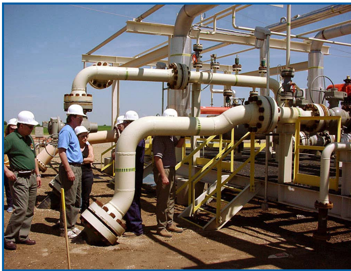
Weyburn-Midale is a commercial-scale project recognized by the Carbon Sequestration Leadership Forum that will utilize CO 2 for enhanced oil recovery. Photo of CO 2 pipeline as it enters Weyburn from Beulah, N.D., courtesy of Petroleum Technology Research Centre.

Management, and the NOSR-2 site was returned to the Northern Ute Indian Tribe. The Energy Policy Act of 2005 transferred administrative jurisdiction and environmental remediation of Naval Petroleum Reserve 2 (NPR-2) in California to DOI, except for eight small unused drill sites in Ford City. DOE retains the Naval Petroleum Reserve No. 3 (NPR-3) in Wyoming (Teapot Dome field).