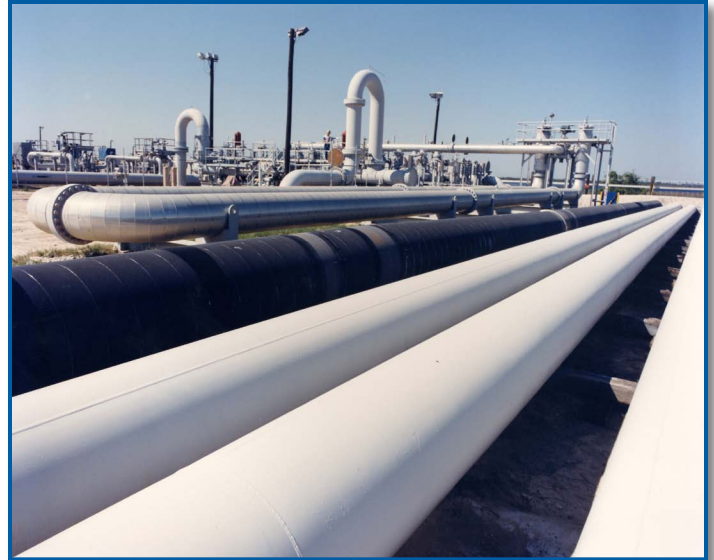
The SPR Bryan Mound site near Freeport, Texas.

The SPR Petroleum Account provides for the acquisition, transportation, and injection of petroleum into SPR, including U.S. Customs duties, terminal throughput charges, and other related miscellaneous costs. During an emergency drawdown and sale, the SPR Petroleum Account is the source of funding for the incremental costs of withdrawing oil from the storage caverns and transporting it to the point