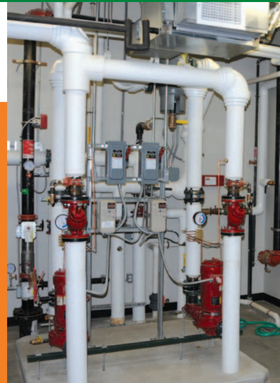
The geothermal heat pump system provides heating and cooling to the building.