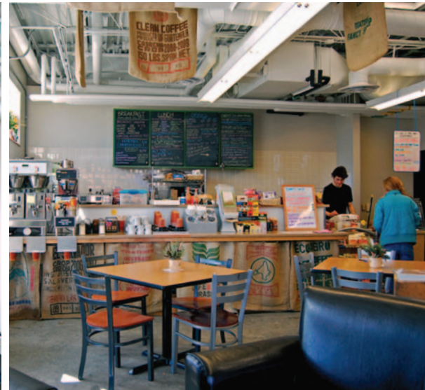
Energy-saving continuous dimming controls are used in retail spaces like the Green Bean Coffee Co.

Completed in May 2009, the Business Incubator not only achieved LEED Platinum status with greater than 50% energy savings—it became the first LEED Platinum certified municipal building in Kansas. The 9,580-square-foot building features five street-level retail shops and nine second-level professional service offices. It provides an affordable, temporary home where businesses can grow over a period of several years before moving out on their own to make way for new start-up businesses. The wide variety of merchants and professionals that occupy the Business Incubator are both long-time and new Greensburg residents.