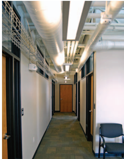
White paint on the overhanging air system maximizes daylight from above.