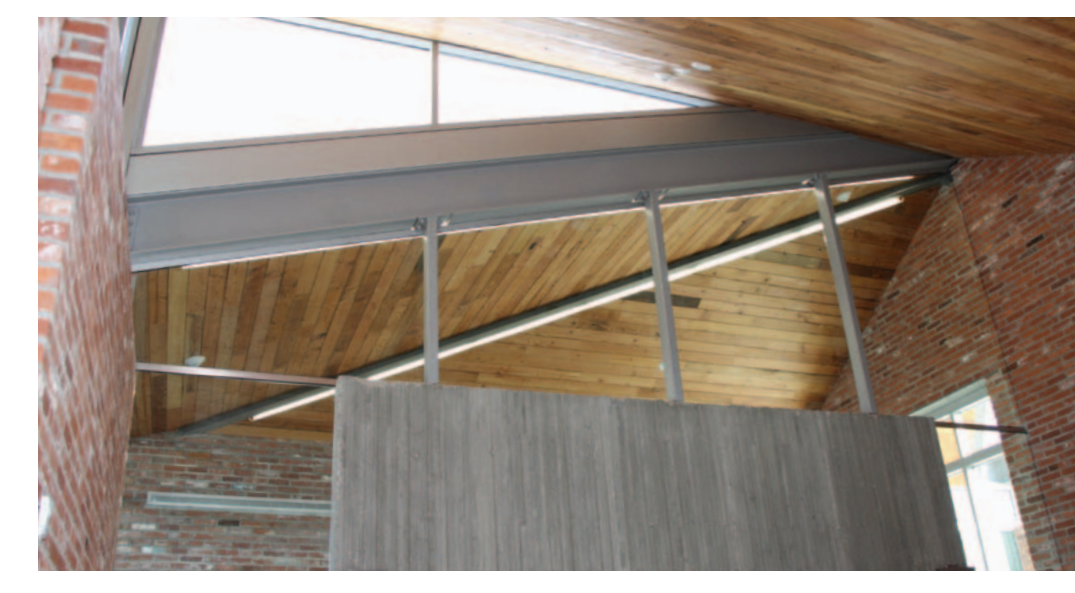
Daylighting built into the roof helps offset electrical lighting needs.