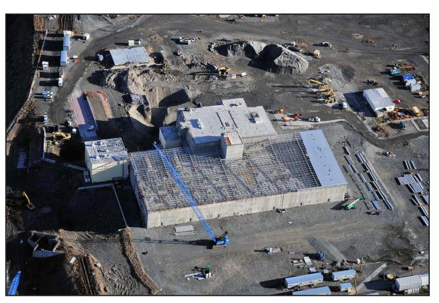
DOE Nuclear Facility Construction Project

(Section 6). Based on the information from these analyses and reviews, the report then discusses the insights and opportunities for improvement (Section 7) and provides recommendations for short-term and long-term actions to improve nuclear facility safety (Section 8). Appendix A provides additional background and details on DOE's approach to nuclear safety.