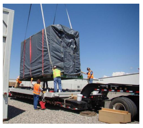
Preparing Low Level Waste for Transport

As discussed in Section 5, 10 CFR Part 830, DOE-STD-3009-94, and DOE Order 151.1C require consideration of BDBEs. However, these documents do not address the specific types of BDBEs that should be analyzed or provide detailed guidance on how the results of the analyses are to be used, as noted in Section 4. Additionally, DOE does not provide detailed expectations regarding the mitigation of severe accidents and BDBEs, differing in this way from the guidance and requirements issued by the NRC or the stress tests initiated by the EU, as discussed in Section 5. Further, the Nuclear Safety Workshop confirmed many of the items noted in the Safety Bulletin analyses discussed in Section 4 and identified additional areas where further requirements and guidance are warranted.