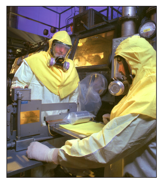
DOE Nuclear Packaging Operation

In regard to BDBEs, the safety analysis requirements in Title 10 CFR Part 830, Nuclear Safety Management , and in the safety analysis development standard used for most DOE nuclear facilities (DOE-STD-3009-94, Preparation Guide for DOE Nonreactor Nuclear Facility Documented Safety Analyses ) require that the site/facility consider the need for analysis of accidents that may be beyond the design basis of the facility in order to provide a complete perspective on the risk associated with operating the facility. DOE provides no amplifying requirements or guidance regarding how "the need for analysis of accidents" is to be considered or documented. DOE also has a safety analysis guide (DOE Guide 421.1-2, Implementation Guide for Use in Developing Documented Safety Analyses to Meet