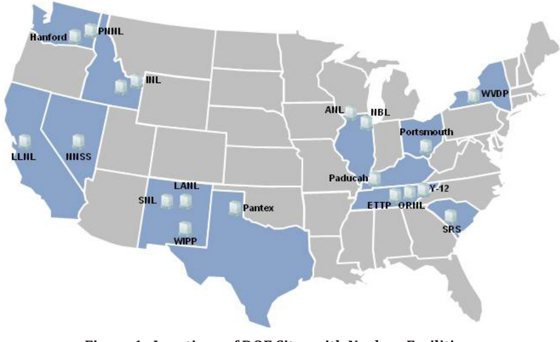
Figure 1. Locations of DOE Sites with Nuclear Facilities (See page i of this report for a list of acronyms)