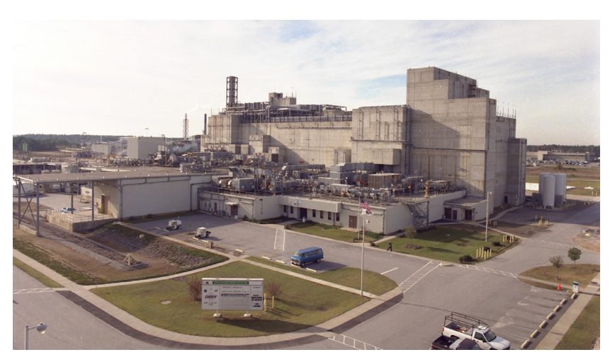
Defense Waste Processing Facility at SRS

DOE conducts three basic types of nuclear operations: nuclear weapons stockpile maintenance, research, and environmental remediation. The operations are performed in a variety of facilities, including nuclear reactors; weapons disassembly, maintenance, and testing facilities; nuclear material storage facilities; processing facilities; and waste disposal facilities. These facilities are located at national laboratories, cleanup sites, research and development sites, and manufacturing sites throughout the United States as shown in Figure 1.