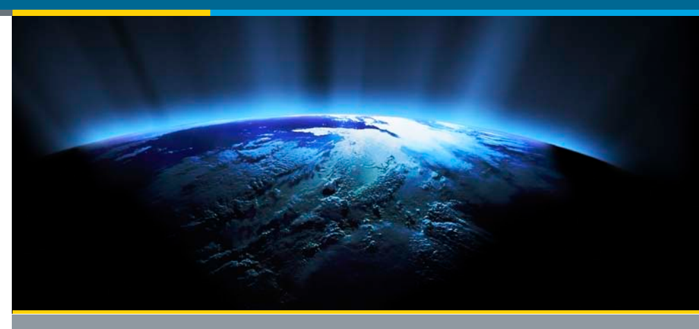
Greehouse gases trap heat in the lower atmosphere, warming the earth's surface temperature.

The U.S. Department of Energy (DOE) Federal Energy Management Program (FEMP) assists Federal agencies with managing their greenhouse gas (GHG) emissions. GHG management entails measuring emissions and understanding their sources, setting a goal for reducing emissions, developing a plan to meet this goal, and implementing the plan to achieve reductions in emissions.