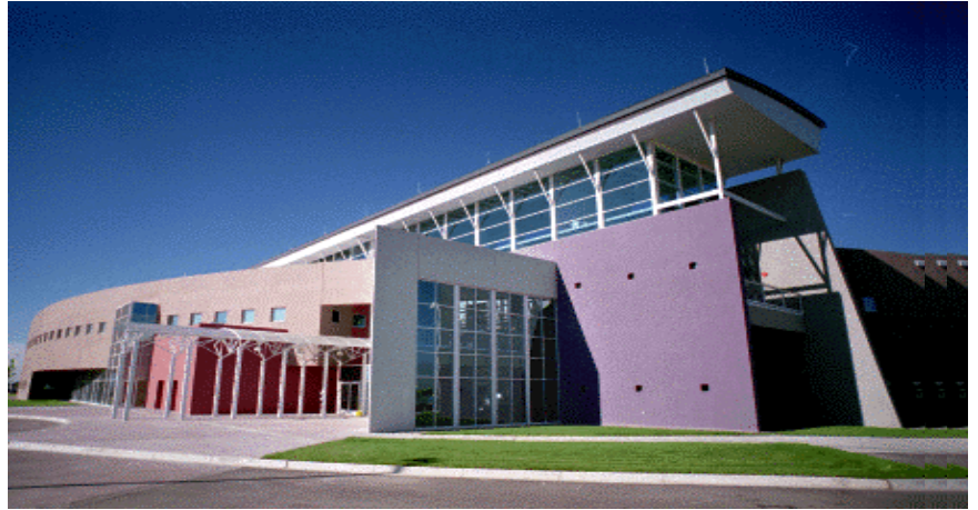
Robotic Manufacturing Science and Engineering Laboratory

Robotics and Intelligent Machines (RIM) have a wide range of applications for solving many operational challenges including nuclear waste cleanup and weapons manufacturing and dismantlement. Within the Department, the Offices of Defense Programs and Environmental Management are the organizations most involved with RIM. We estimated that Defense Programs funded about $14 million and Environmental Management funded about $24 million of Department RIM projects. It is anticipated that funding for these activities will increase substantially in the future. We focused our review on Defense Programs RIM research and development projects to determine if they were effectively managed.