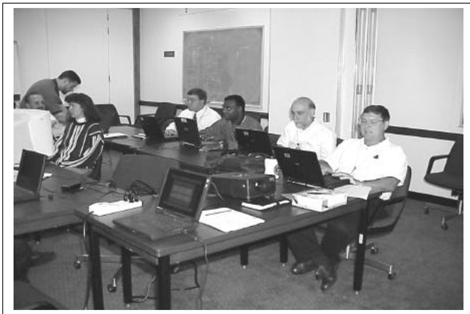
Pilot Members Hard at Work

We also began a pilot implementation of an electronic workpaper solution in July 1999. A total of 16 pilot participants attended a 2-day training session on electronic workpapers held in Washington, DC. Pilot implementation testing is proceeding in each of the OIG divisions described above and should conclude during the second quarter of FY 2000.