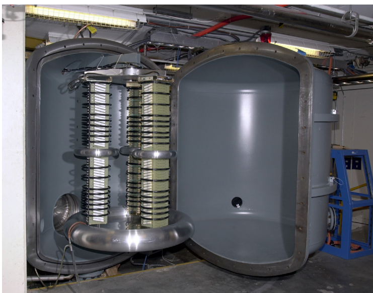
FEL High Voltage Power Supply

FEL makes extensive use of engineered controls for personnel protection that are supplemented by administrative controls, such as rigorous certification of the protection systems following modification and extensive training requirements. For example, the FEL Laser Safety Training for system modifications is comprehensive and appropriately addresses the requirements of the FEL laser standard operating procedure. The practical training is particularly effective in demonstrating the operation of the system, including responses to use of crash buttons and other interlock challenges.