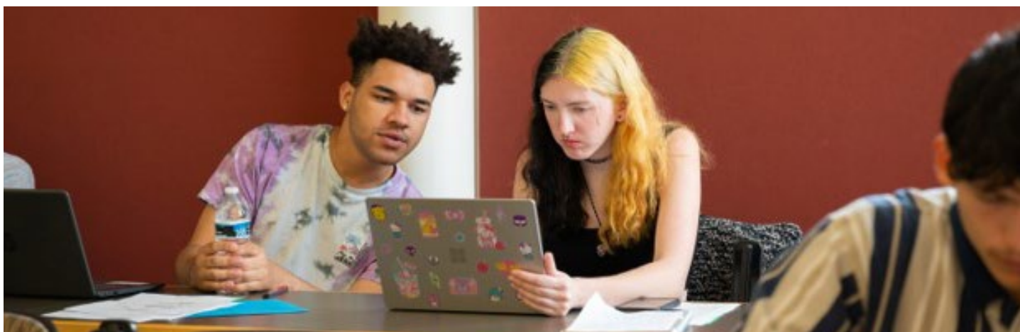
Students engaging on coursework at Waubensee Community College.