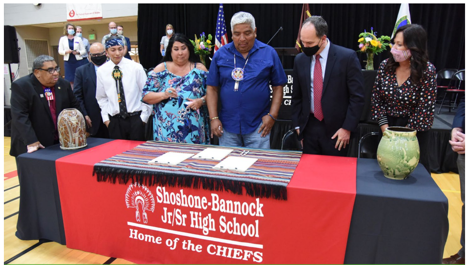
Signing Ceremony for the Memorandum of Understanding (MOU) establishing the Idaho National Laboratory partnership with the Shoshone-Bannock Tribes setting the stage for the BRIDGES waste-to-energy case study.