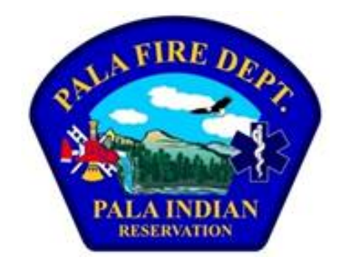
Pala Fire Department