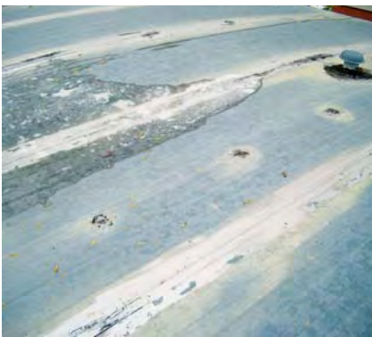
Roof seams, and screws in trusses are typical leak sites.

A major consequence of this scenario will be backdrafting of any atmospheric appliance in the pressure zone. This can include the water heater, if a bypass from the water heater to the main body of the house exists. Furnace efficiency will be reduced as the cold air is drawn into the negatively pressurized structure. This scenario will not usually cause cavity moisture problems, since the cold air will dry the home as it is brought in. But in hot and humid cooling climates, the flow of moist outside air into the building envelope can lead to condensation.