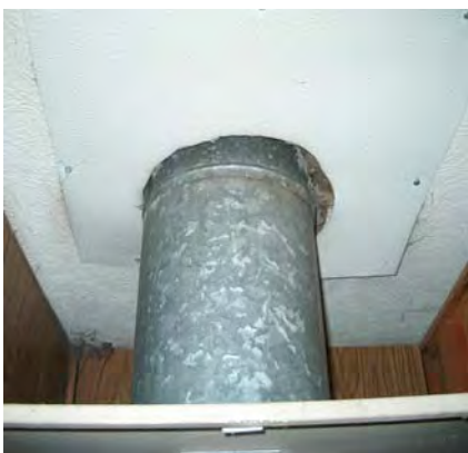
The penetrations around the flue into the attic should be sealed.

pressure neutral, depending on the size and location of the penetrations involved. We do not generally see moisture problems in these homes.