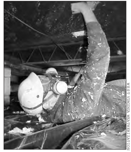
After cutting access holes through the belly board of the mobile home, push any existing insulation aside so that the flexible fill tube can slide the length of the joist cavity for a complete fill.

The West Virginia WAP has recently started to perform electric baseload measures. Compact fluorescent bulbs can be used to replace any incandescent bulb that is on at least two hours per day. Refrigerators can be replaced with