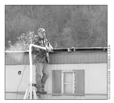
A worker blows fiberglass into the cavity of the mobile home roof. Note the 2 \times 4s used as wedges to hold the roof cavity open. A small amount of blowback can be seen.

For both types of floor construction, start at one end and cut a row of access holes in the belly board so that you can insert the blower hose into the joist cavities. If the floor joists run crosswise, cut your holes near the center of the trailer. Usually you will be able to snake the flexible hose to each of the long edges of the home from holes along the center. If the floor joists run lengthwise, cut a row of holes into each joist cavity across the belly. With either construction, fill the cavity from one direction and then from the other. Make sure to fill the entire