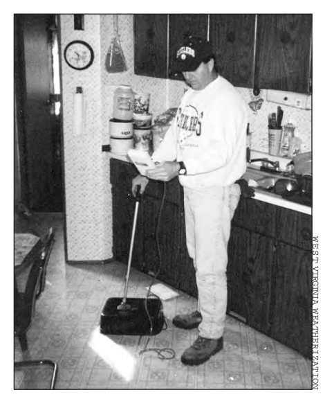
Along with a visual inspection, a pressure pan test is performed.

Place the pressure pan completely over the register opening to form a tight seal. Allow enough time for the reading