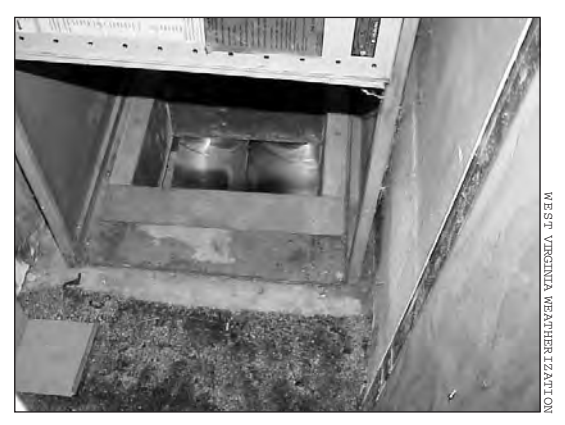
The plenum is a major area of air leakage. Too often when the mobile home is transported, movement causes the furnace plenum and the main duct run to separate, causing heat from the furnace to flow directly into the belly board instead of the ductwork.

Making the heating unit safe and efficient, while important, is only part of making the entire heating system as efficient as possible. The condition of the