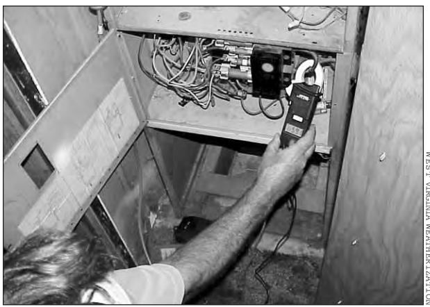
(left) Missing or badly damaged boots can be replaced to help air seal and increase the efficiency of the heating delivery system. (right) It is important to test the parts of an electric furnace. Many times, wires have been disconnected or improperly connected. This can pose a serious safety hazard.

kerosene heaters, or at least to have them stored in a place where they will be used only in an emergency, such as in a power outage.