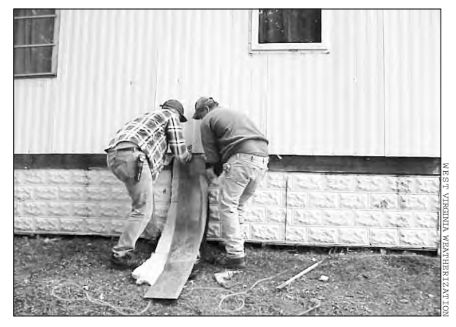
(left)To fill the outer area of the mobile home floor, a muffler pipe is attached to the flexible hose. The natural curve of the pipe makes it easy to rotate the pipe in the cavity to get maximum fill. (right) Batt stuffing is one way to reinsulate the walls of mobile homes. Remove the bottom two rows of screws, and you can stuff the insulation into the cavity using a strong, flexible plastic stuffer.

no significant air leaks into the roof cavity or in the floor.