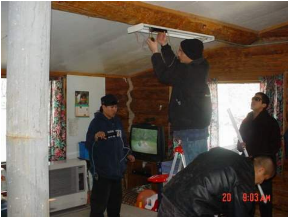
Figure 11 Energy Conservation Project team