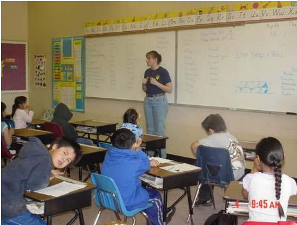
Figure 17 Energy Curriculum in Schools