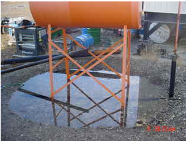
Figure 24 Fuel Tracking 1