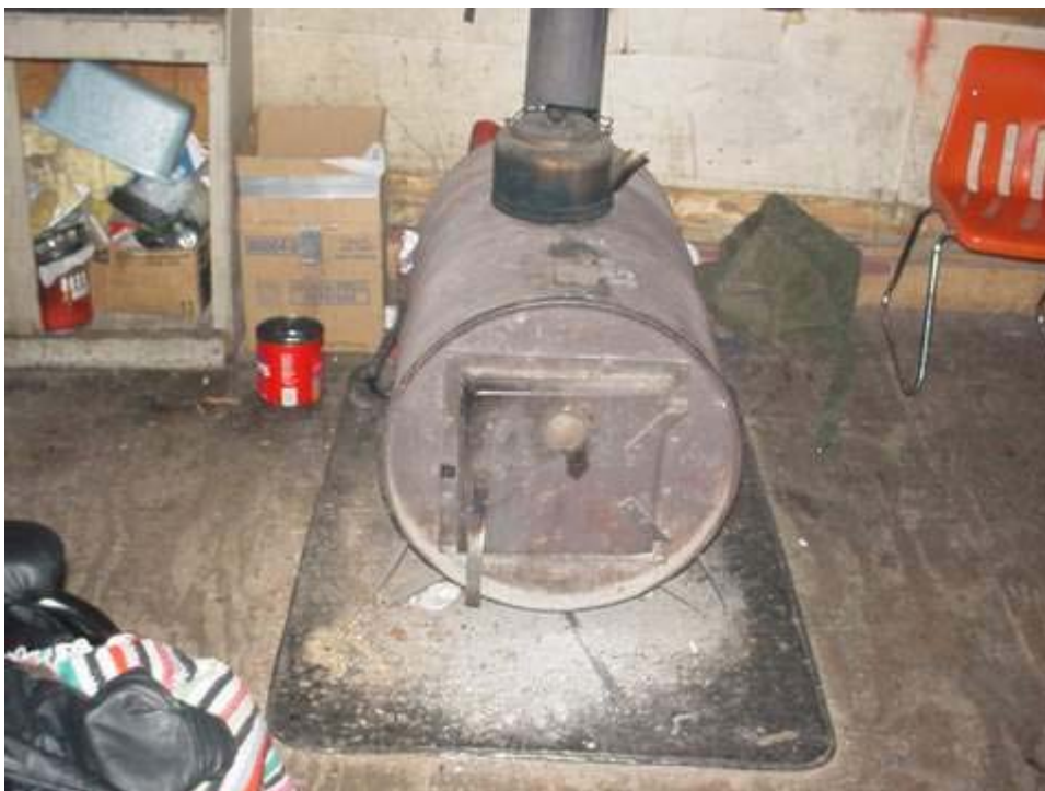
Figure 32 Traditional Heating sources