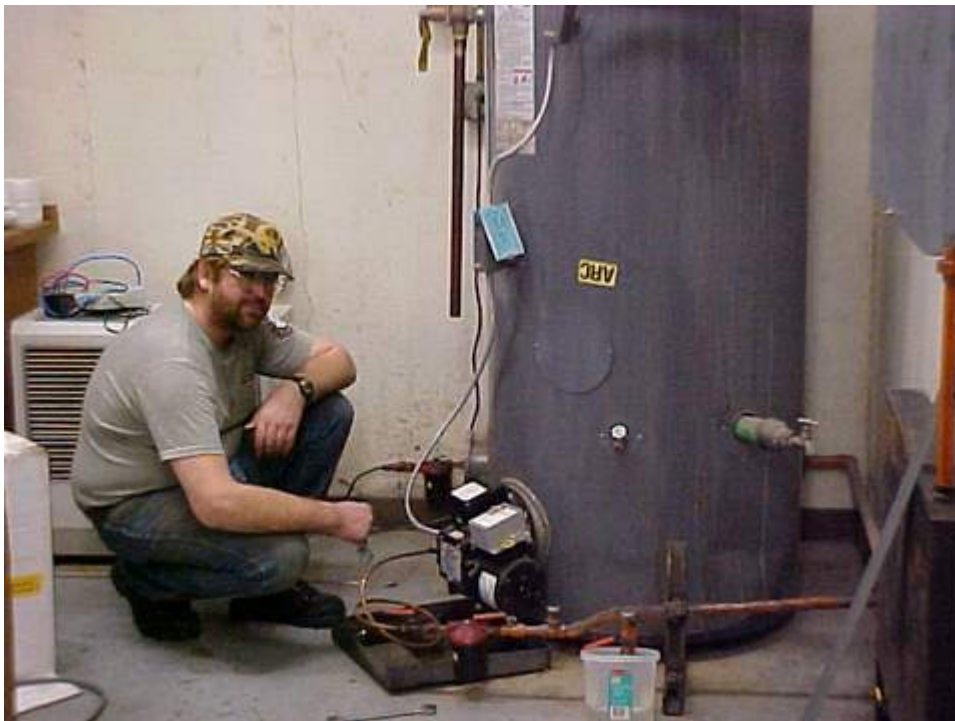
Figure 16 Commercial fuel efficiency testing