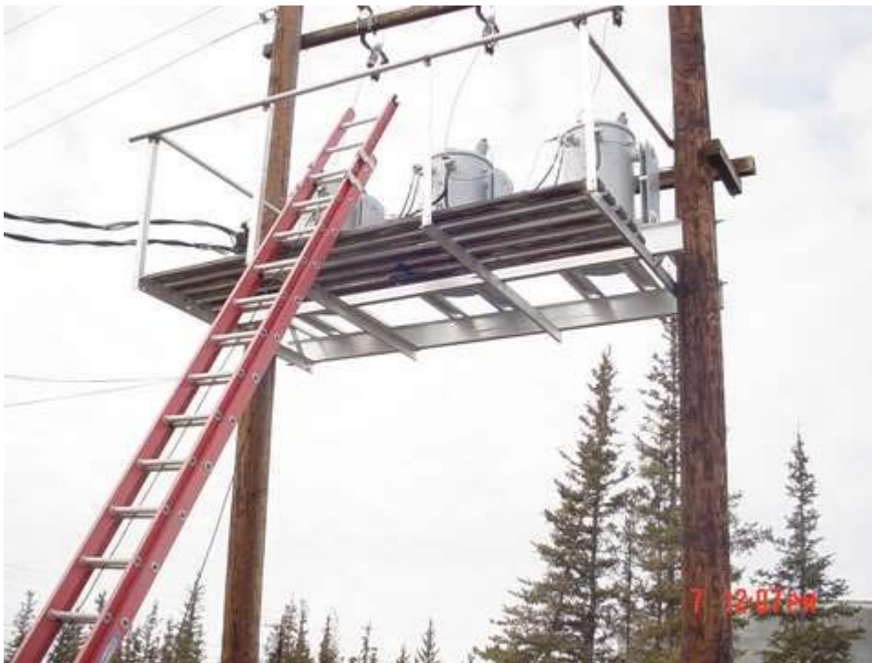
Figure 15 Line monitoring Setup