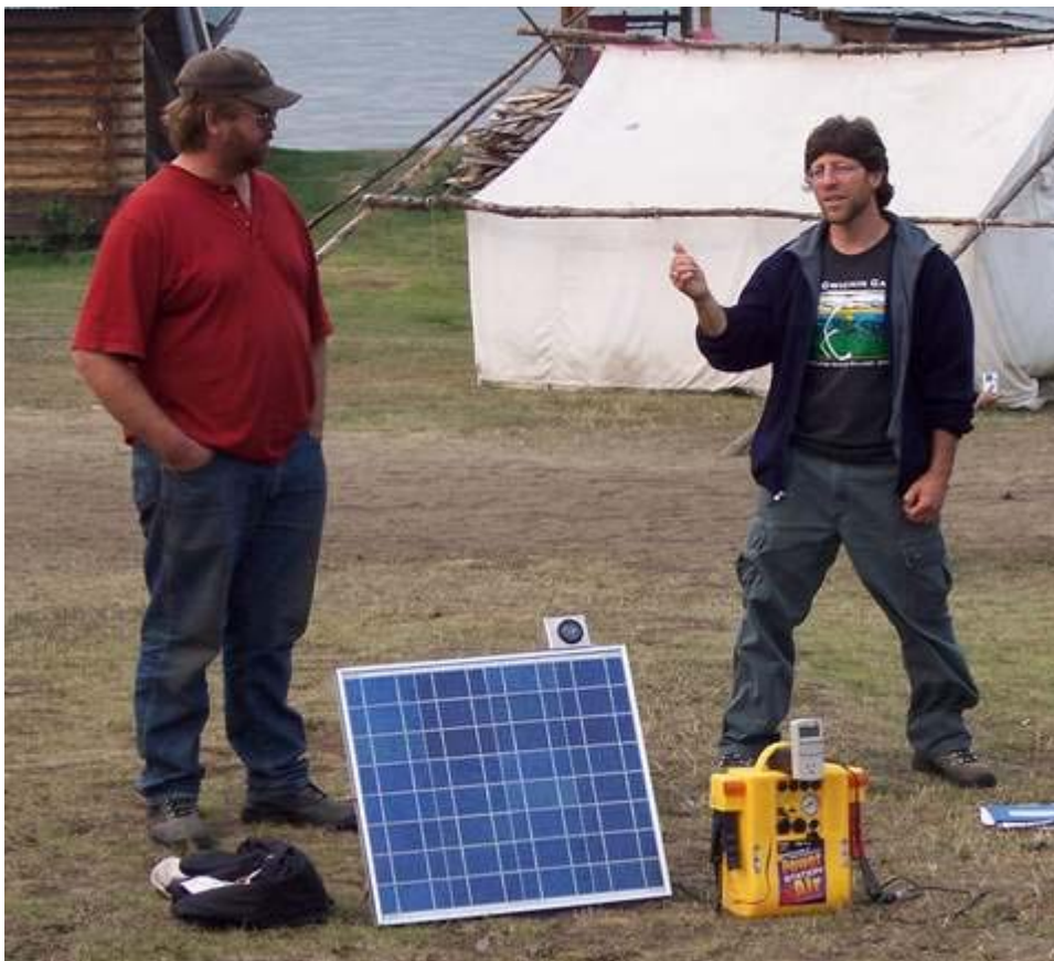
Figure 5 Renewable Energy Education presentations