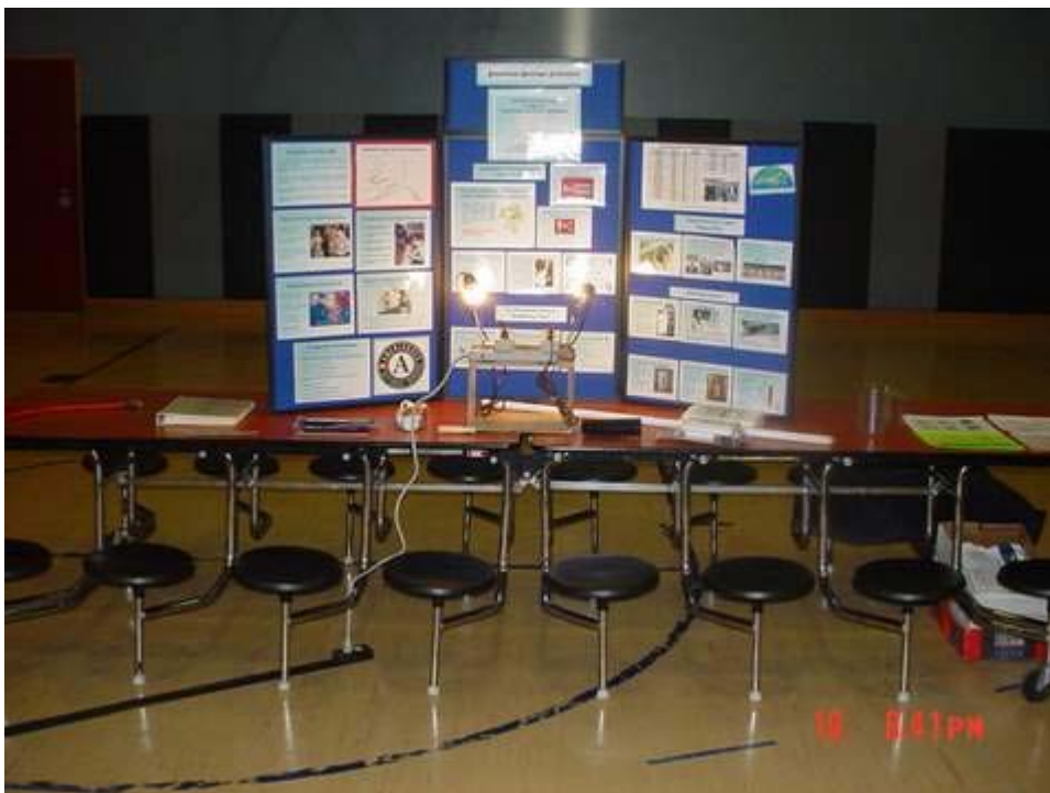
Figure 12 Community Energy Fair