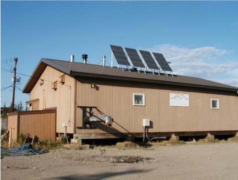
Figure 3 Venetie Fixed Array