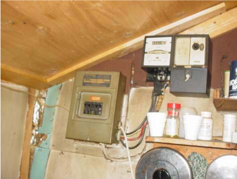
Figure 37 Pay as you go metering