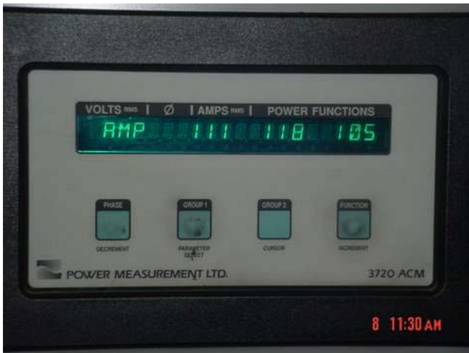
Figure 26 Line Equalization monitoring