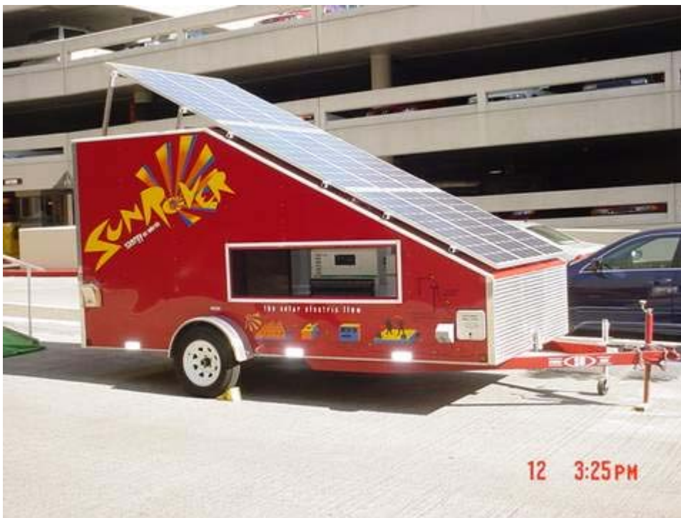
Figure 28 Attending RE events Solar Fair Portland, Ore