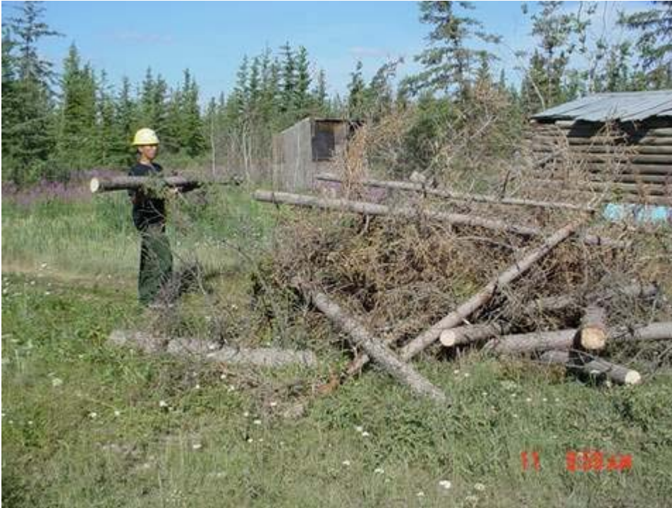
Figure 21 Wood resources inventory