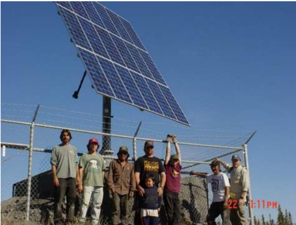
Figure 2 Arctic Village Tracking Array