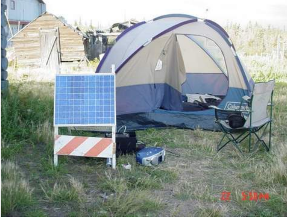
Figure 6 Education through practacle applications