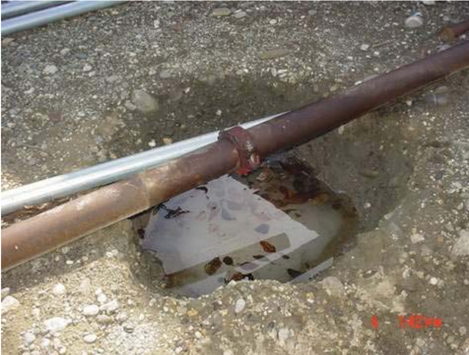
Figure 25 Fuel Tracking 2