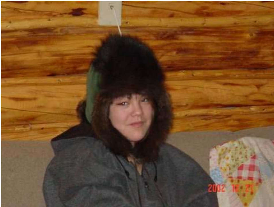
Figure 31 Lower Home Thermostats