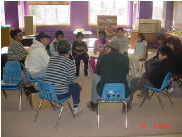
Figure 8 Presentations in local schools