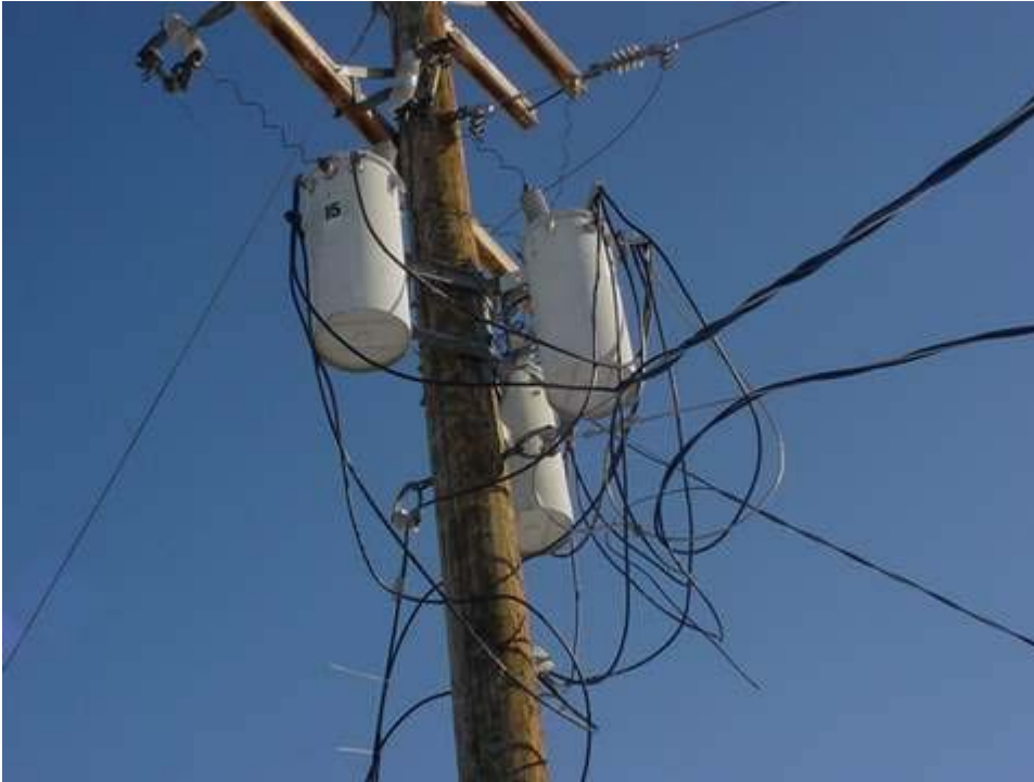
Figure 23 Distribution upgrades/Line equalizations