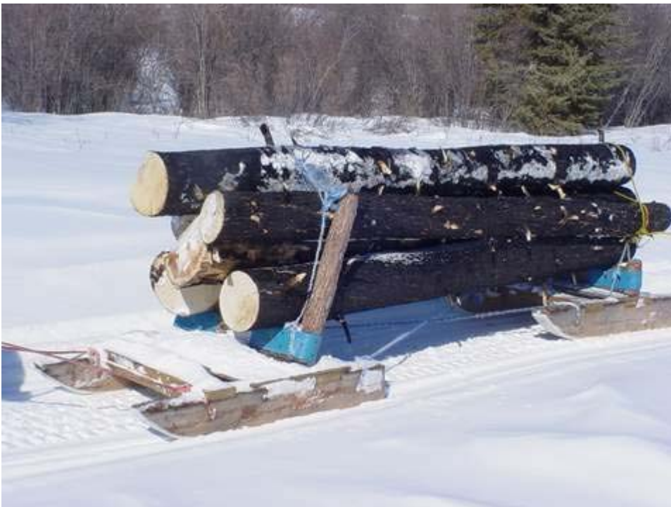
Figure 22 Post fire recovery of fuels