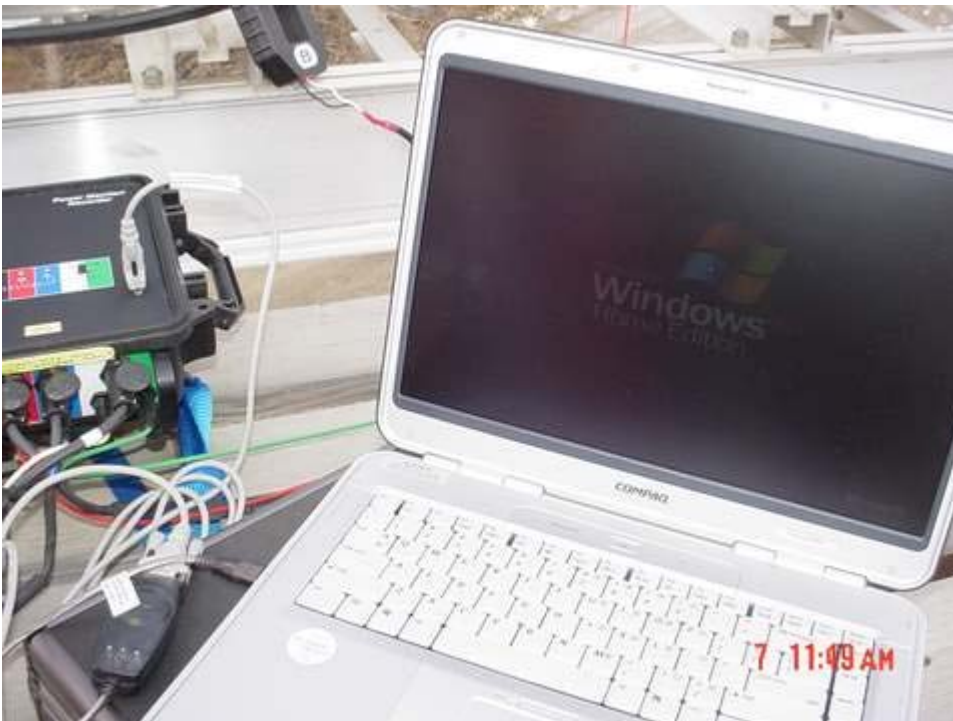
Figure 14 Energy Tracking 1