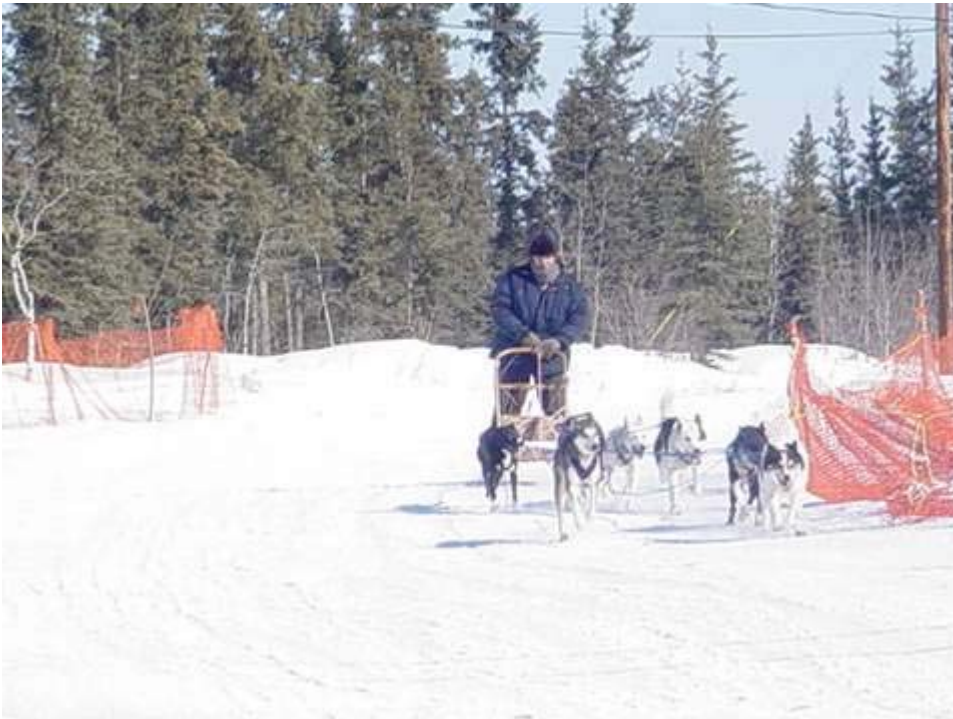
Figure 30 Traditional Transportation Techniques