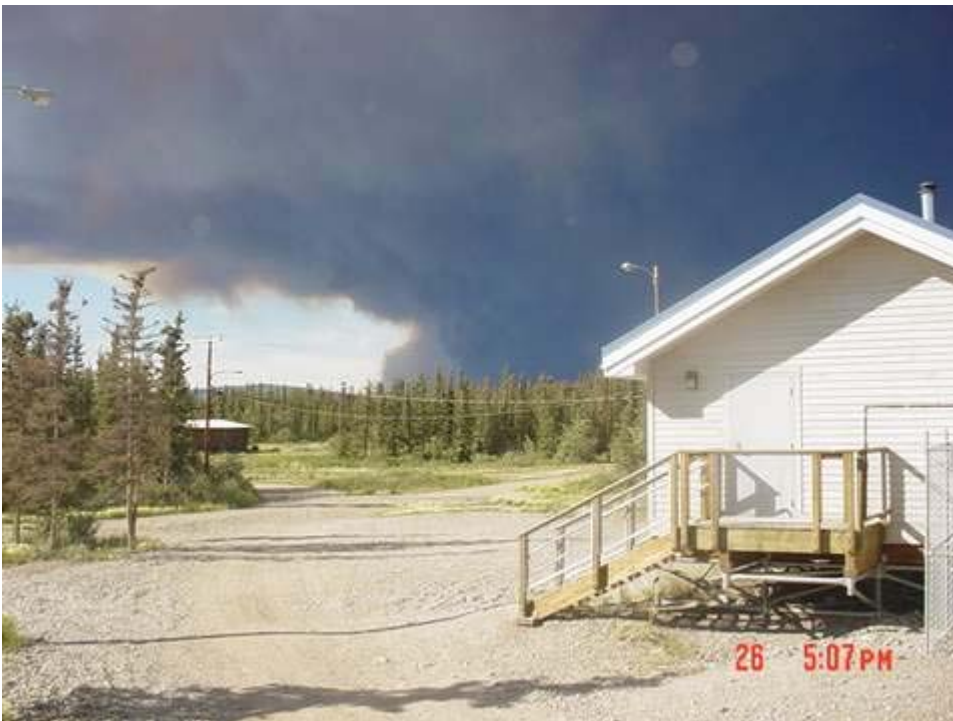
Figure 20 RE for Emergency Communications....Forest Fire 1 mile away