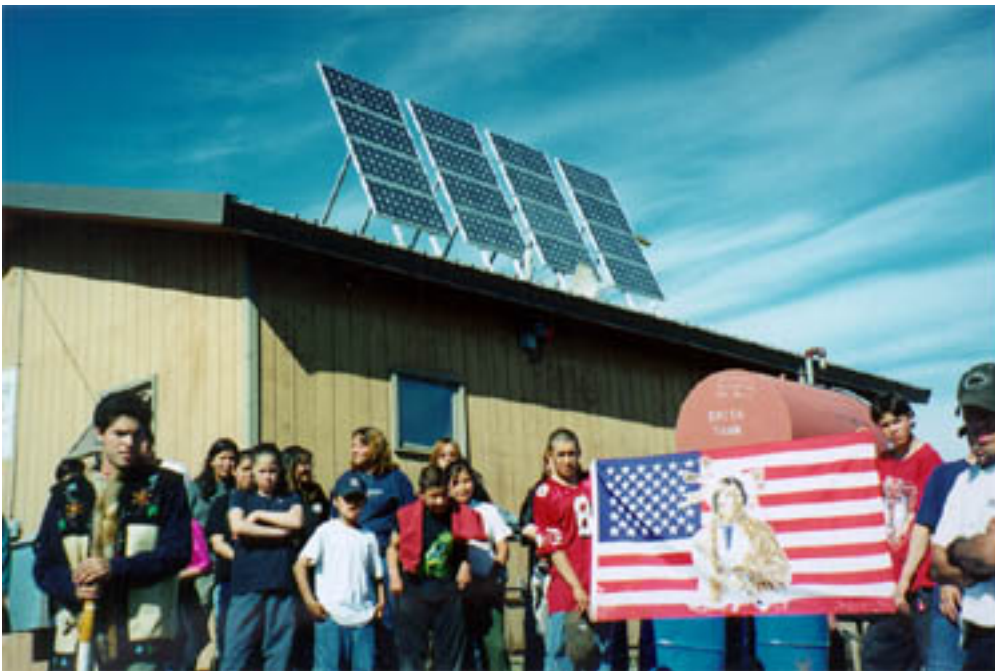
Figure 38 Thank You USDOE