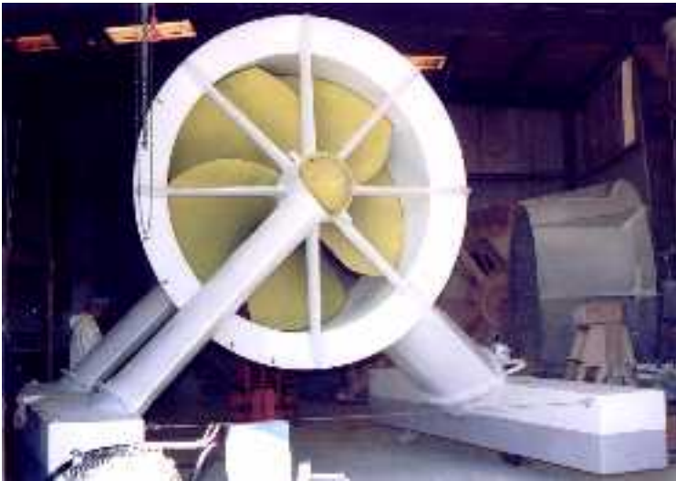
Figure 34 New Tech Run of River Hydro