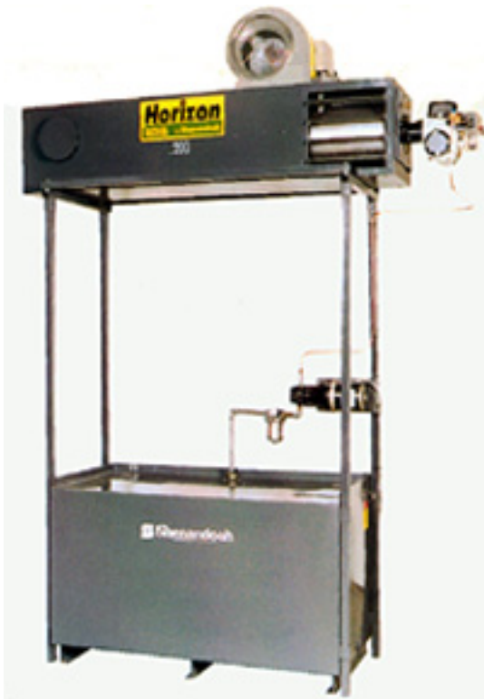
Figure 18 Used Oil Heaters