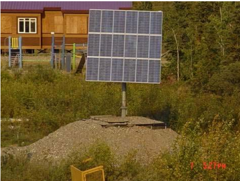
Figure 4 Venetie Tracking Array