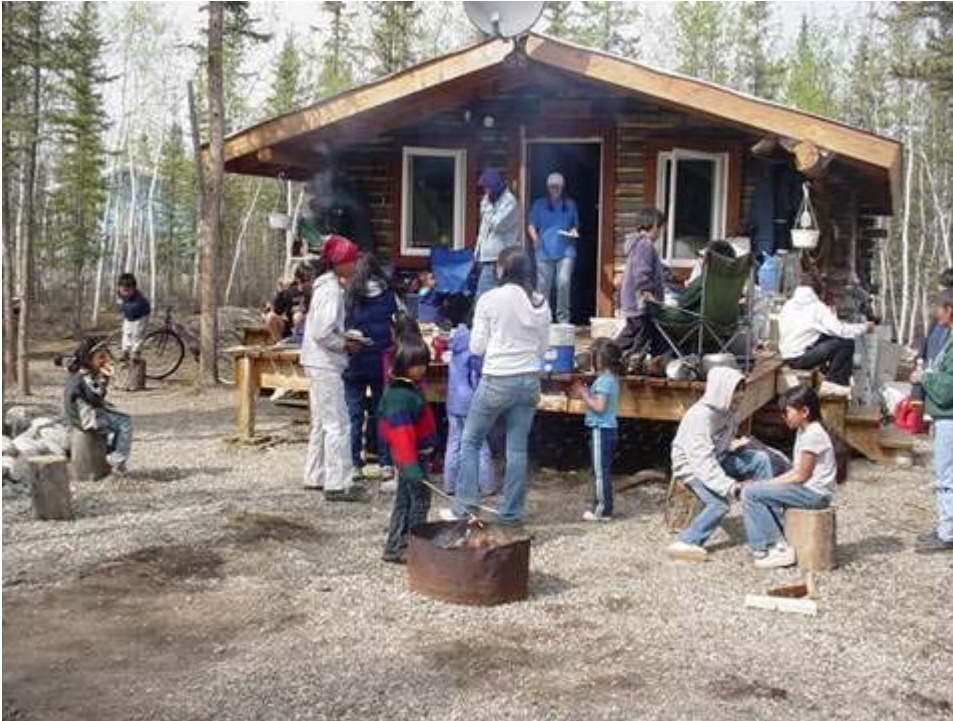
Figure 19 Home Energy Audits