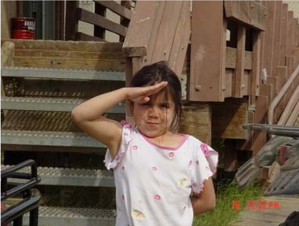
Figure 13 Reporting for duty, Sir Youth Energy Patrol