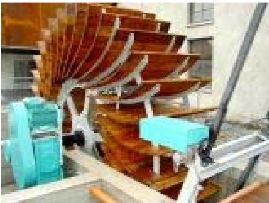
Figure 35 Water Wheel Generators