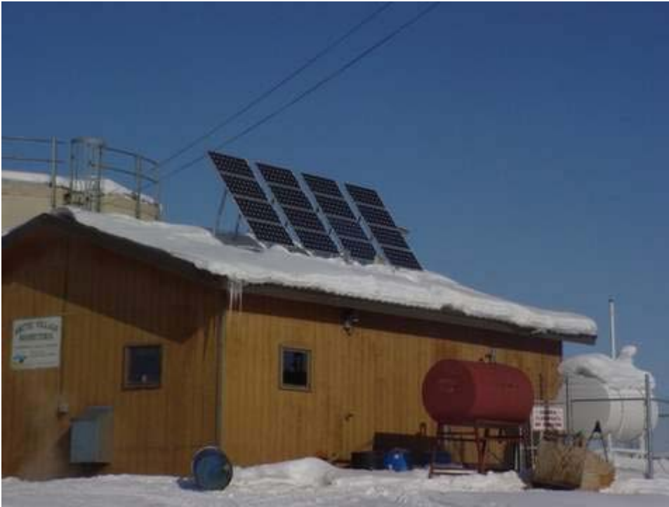
Figure 1 Arctic Village Fixed Array