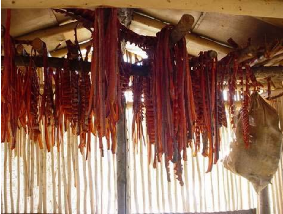
Figure 29 Traditional Food Preservation techniques 1