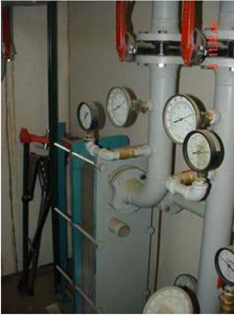
Figure 27 Waste Heat Recovery