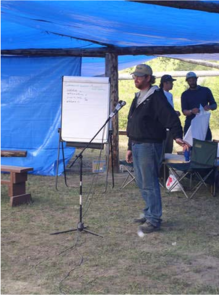
Figure 7 Presentations at various large gatherings to promote RE