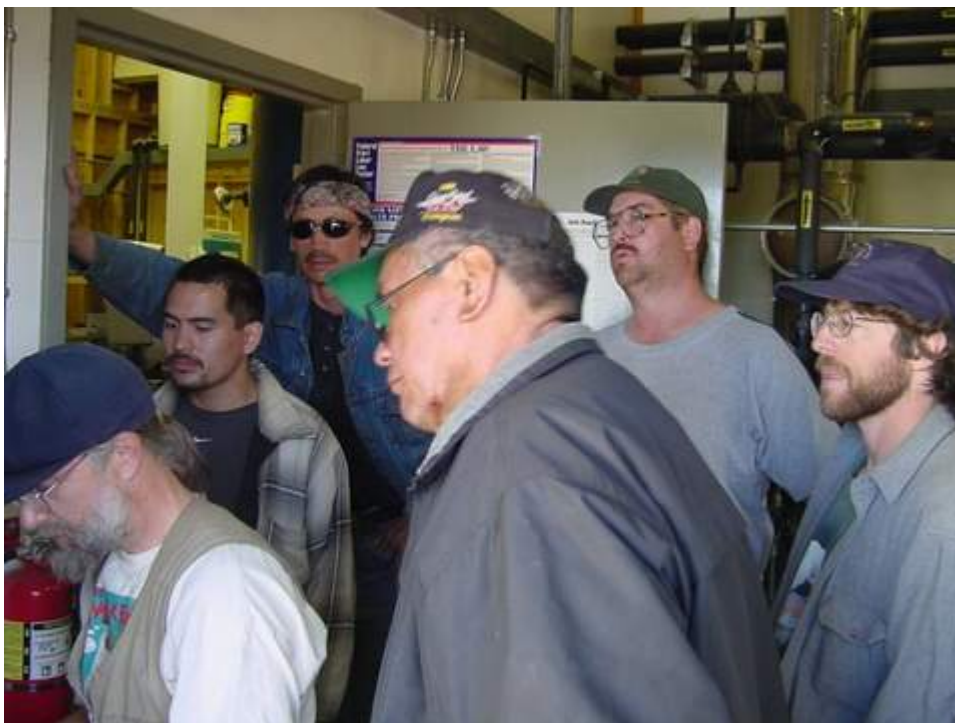
Figure 10 Local Installation/Maintenance skills