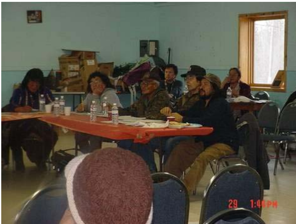
Figure 9 Tribal Energy Summit - 3 Councils