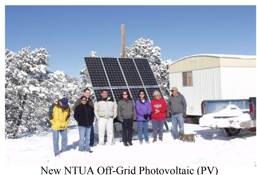
New NTUA Off-Grid Photovoltaic (PV) Hybrid Unit

Navajo Nation received $3M FY03 funding with $800k for PV hybrid units. Sandia support includes: