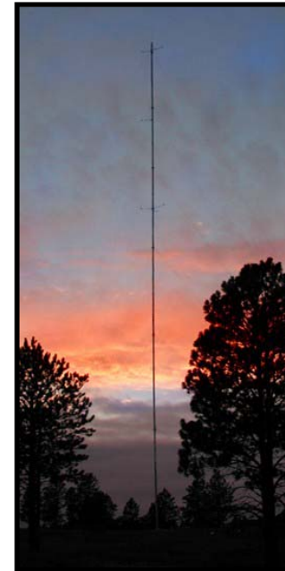
Northern Cheyenne Nation Wind Resource Assessment