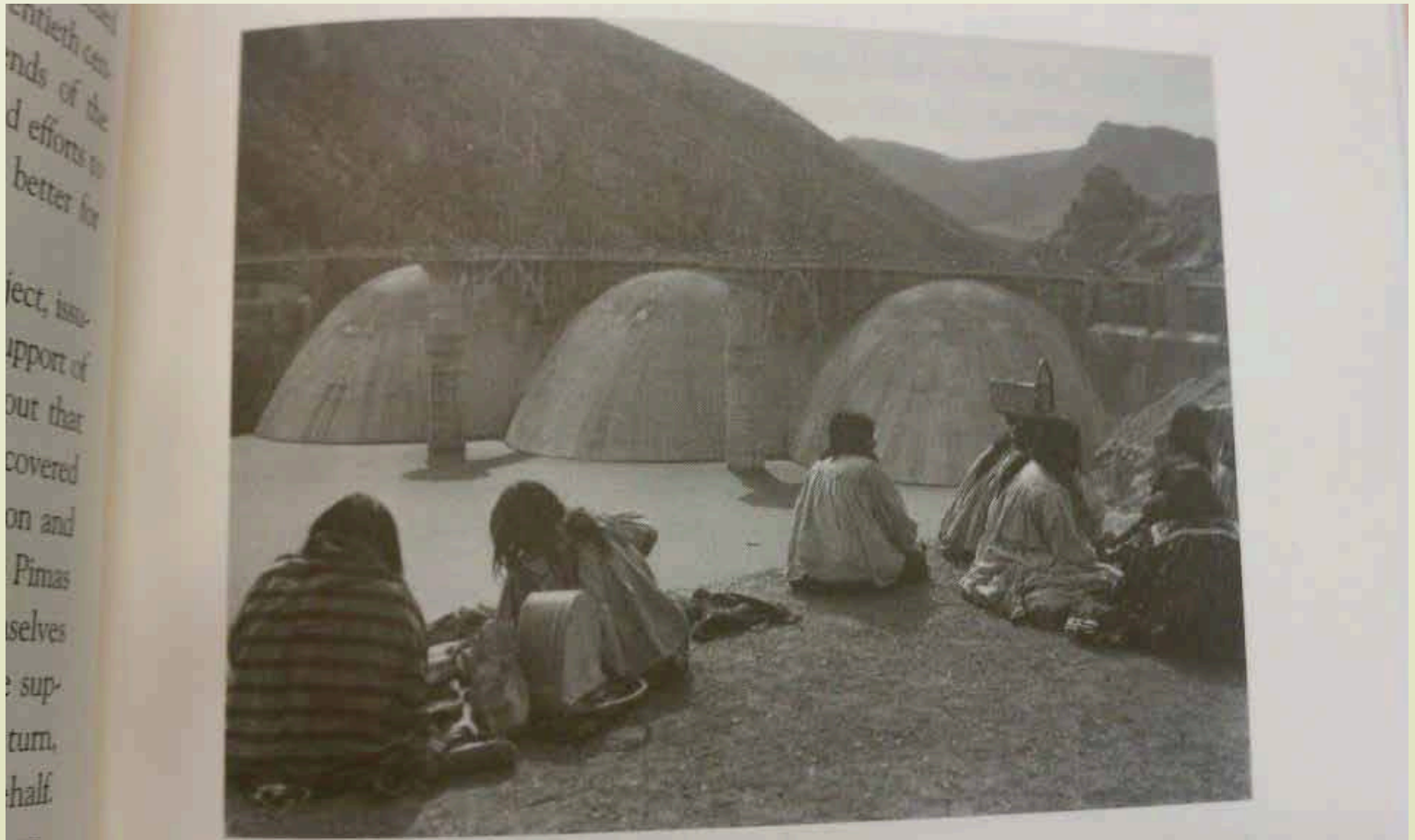
Coolidge Dam circa 1930's