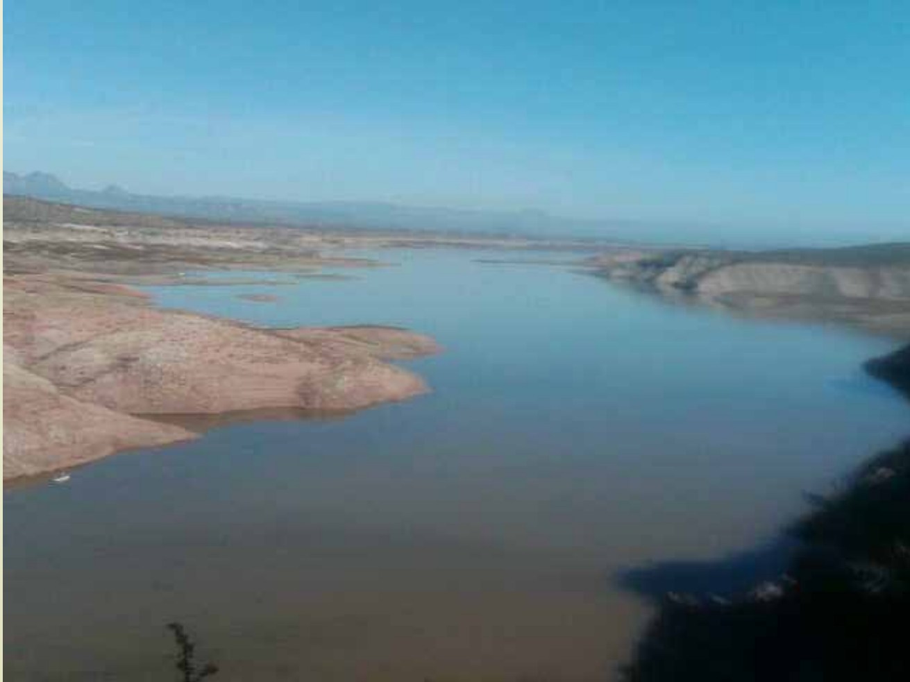
San Carlos Lake @ Low Water