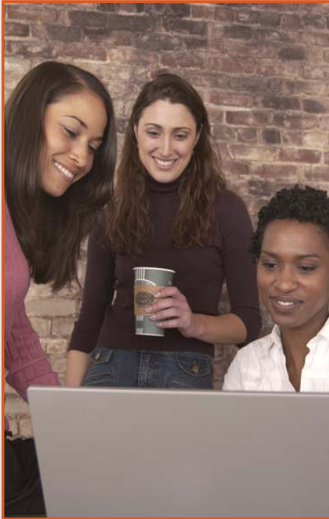
Communities of Interest