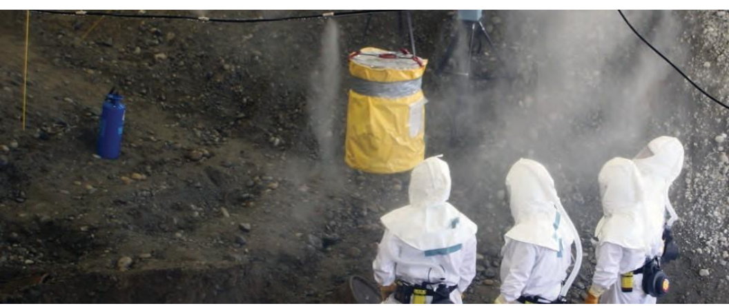
Department of Energy, Hanford Site - Richland