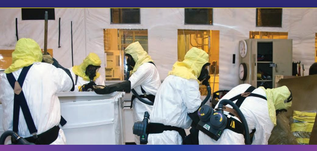
A Basic Overview of the