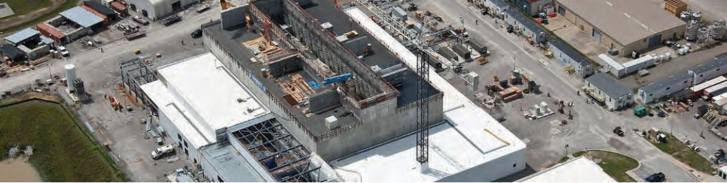
Department of Energy, Savannah River Site - Salt Waste Processing Facility (SWPF)

http://www.energy.gov/ehss/downloads/job-safety-and-health-poster