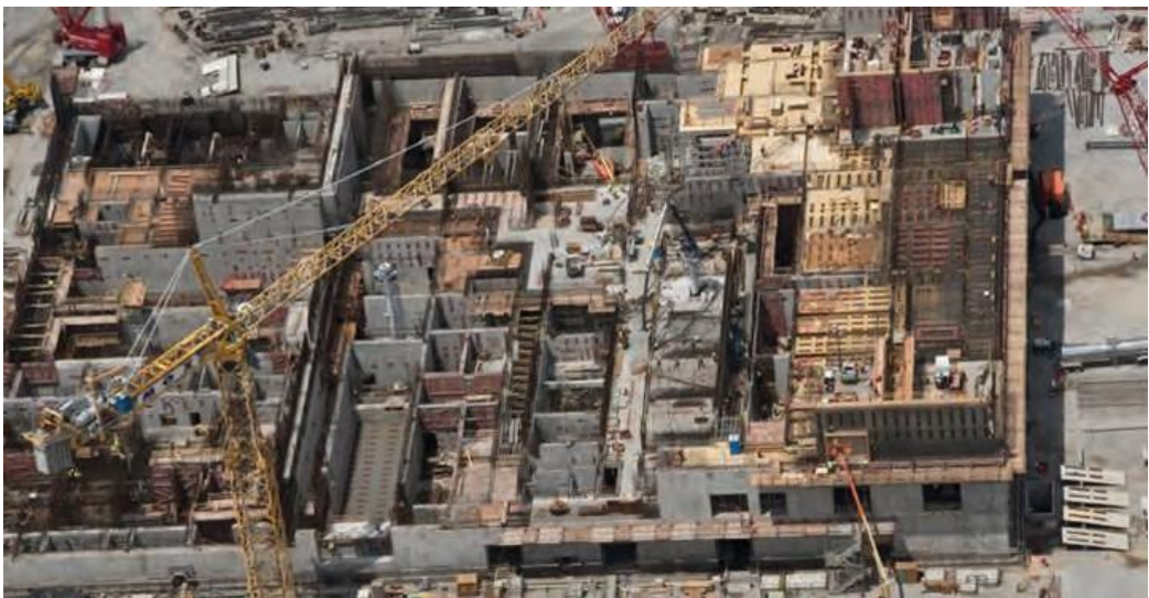
Department of Energy, Savannah River Site - Mixed Oxide Fuel Fabrication Facility Under Construction