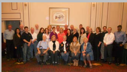
BTMed team meets to discuss plans for the coming year, which includes expansion of the CT scanning program

Based on new data, BTMed estimates that work at DOE facilities has been responsible for approximately 20,000 cases of occupational lung cancer in construction workers. Early detection of lung cancer using CT scans with low radiation dose has recently been proven to be effective in preventing premature deaths. The effort relies on low-dose CT scans to