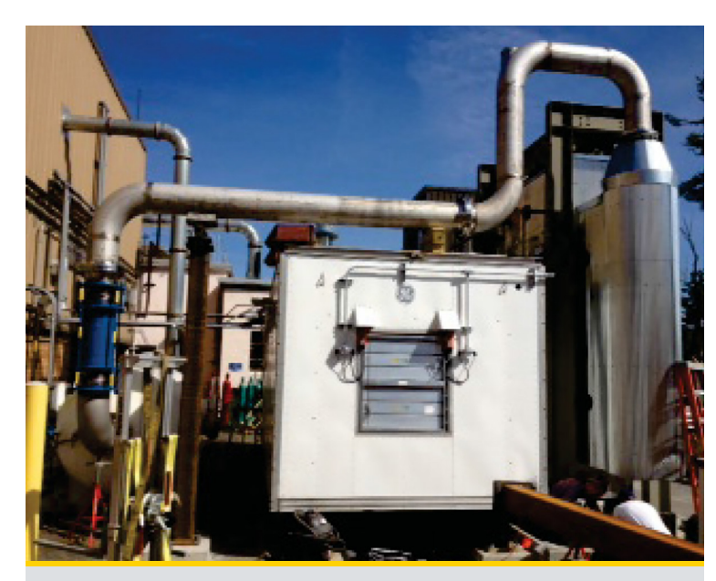
The direct evaporator and supporting equipment installed at the GE test facility.

GE has more than 1,800 simple cycle gas turbines installed in North America and Europe that cumulatively generate more than 60 GW of electrical power. If 20% of this installed base were retrofitted with the proposed ORC technology, 3 GW of additional electrical power could be produced, which would effectively utilize 90 trillion Btu of waste heat per year. These energy savings represent CO<sub>2</sub> emission savings of 4.8 million metric tons, and economic savings of $630 million. An anticipated additional