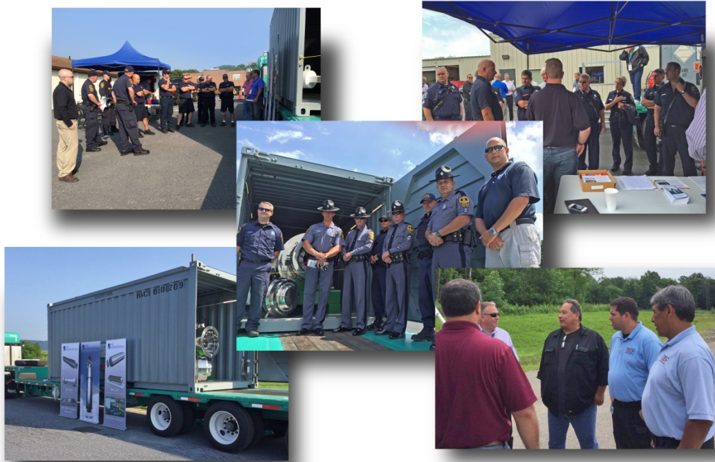
Figure 2. Demonstration Equipment and Attendees

a Summary of training classes and exercises in the listed states in the listed states conducted by DOE from May 1, 2012, through March 18, 2015.