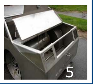
Training prop features: (3) mock fuel cell stack, (4) mobile capability, (5) mock hydrogen storage tank.