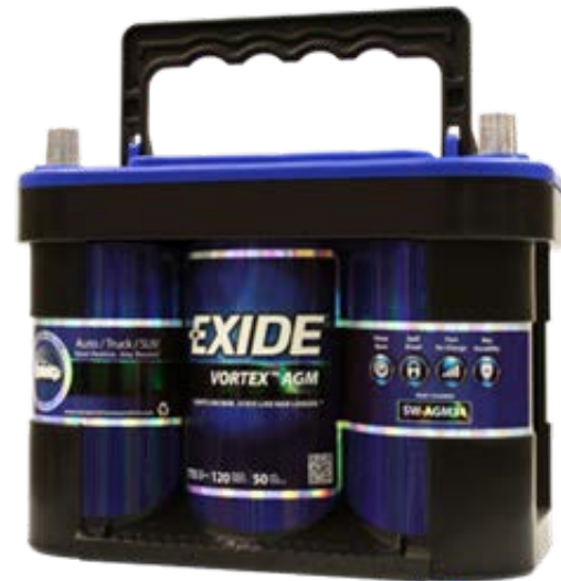
Spiral Wound AGM Battery