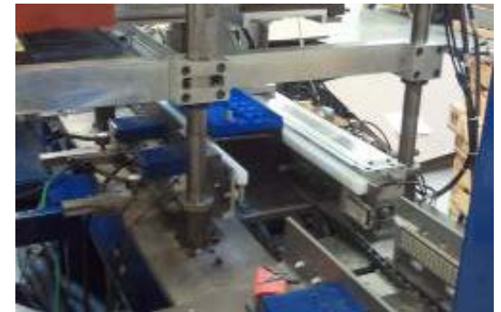
Production Validation is Proceeding on the New Advanced AGM Battery Assembly Expansion Line – Columbus, Georgia Exide Battery Plant