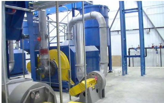
New High Purity Lead Oxide Manufacturing Operation in the new AGM area in the Bristol, Tennessee Exide Battery Plant