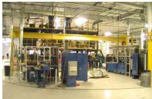
Automated Spiral Wound Plate Manufacturing Line in New Advanced AGM Battery Area in Bristol, Tennessee Exide Plant