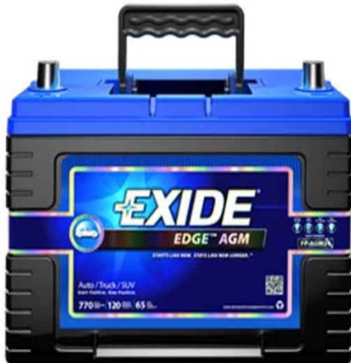
Flat Plate AGM Battery