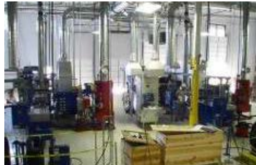
State of the Art Grid Manufacturing Operation in the new AGM Battery Operation in Bristol, Tennessee Exide Plant