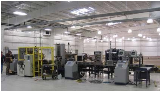
New State-of-the-Art AGM Battery Assembly Operation in Columbus, Georgia Exide Battery Plant