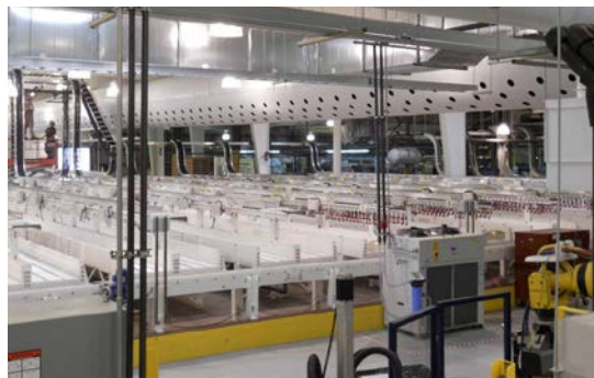
Significant Additional Production Capacity in Battery Formation Department – Columbus, Georgia Exide Battery Plant