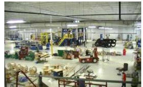
Overall View of new AGM Battery Production area in Bristol, Tennessee Exide Battery Plant