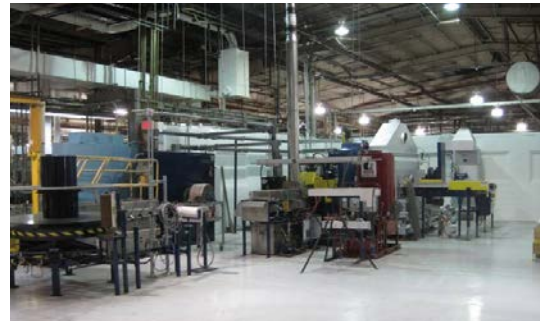
New World-Class Continuous Plate Manufacturing Operation in Columbus, Georgia Exide Battery Plant