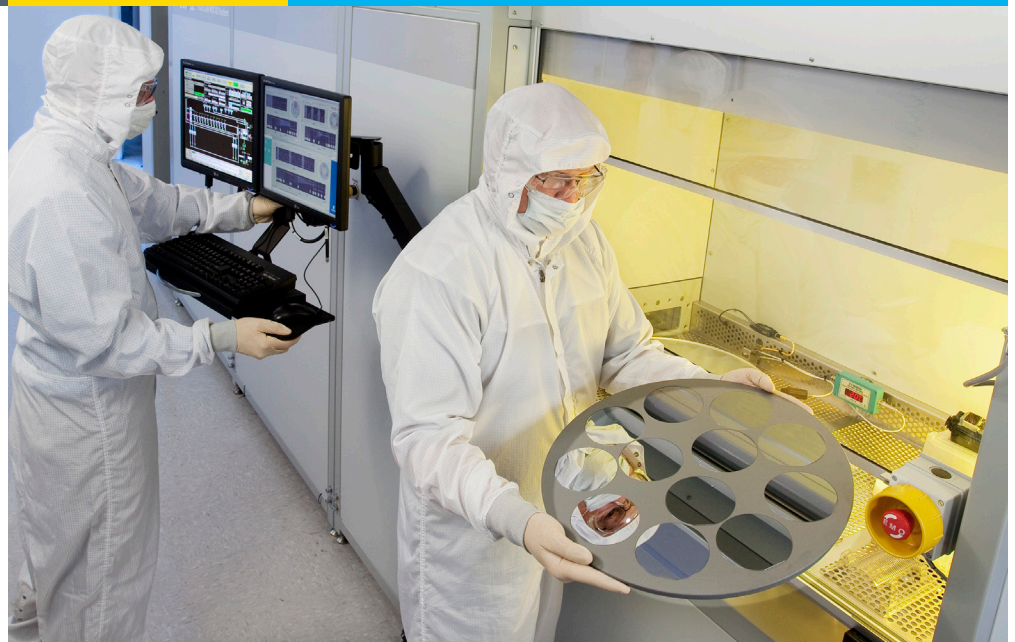
Veeco engineers remove a wafer carrier from a TurboDisc K465i GaN MOCVD System.

Launched in 2009, the U.S. Department of Energy's SSL Manufacturing R&D Initiative engages producers in the drive for better-performing, lower-cost solid-state lighting, while encouraging them to engineer and manufacture in the United States. Initially funded through the American Recovery and Reinvestment Act (ARRA), the effort has demonstrated that clean energy strategies and cost-shared R&D through public-private partnerships can yield impressive results. Today, the initiative continues to co-fund R&D awarded through competitive solicitations and to build the network of companies working to strengthen U.S.-based SSL production.