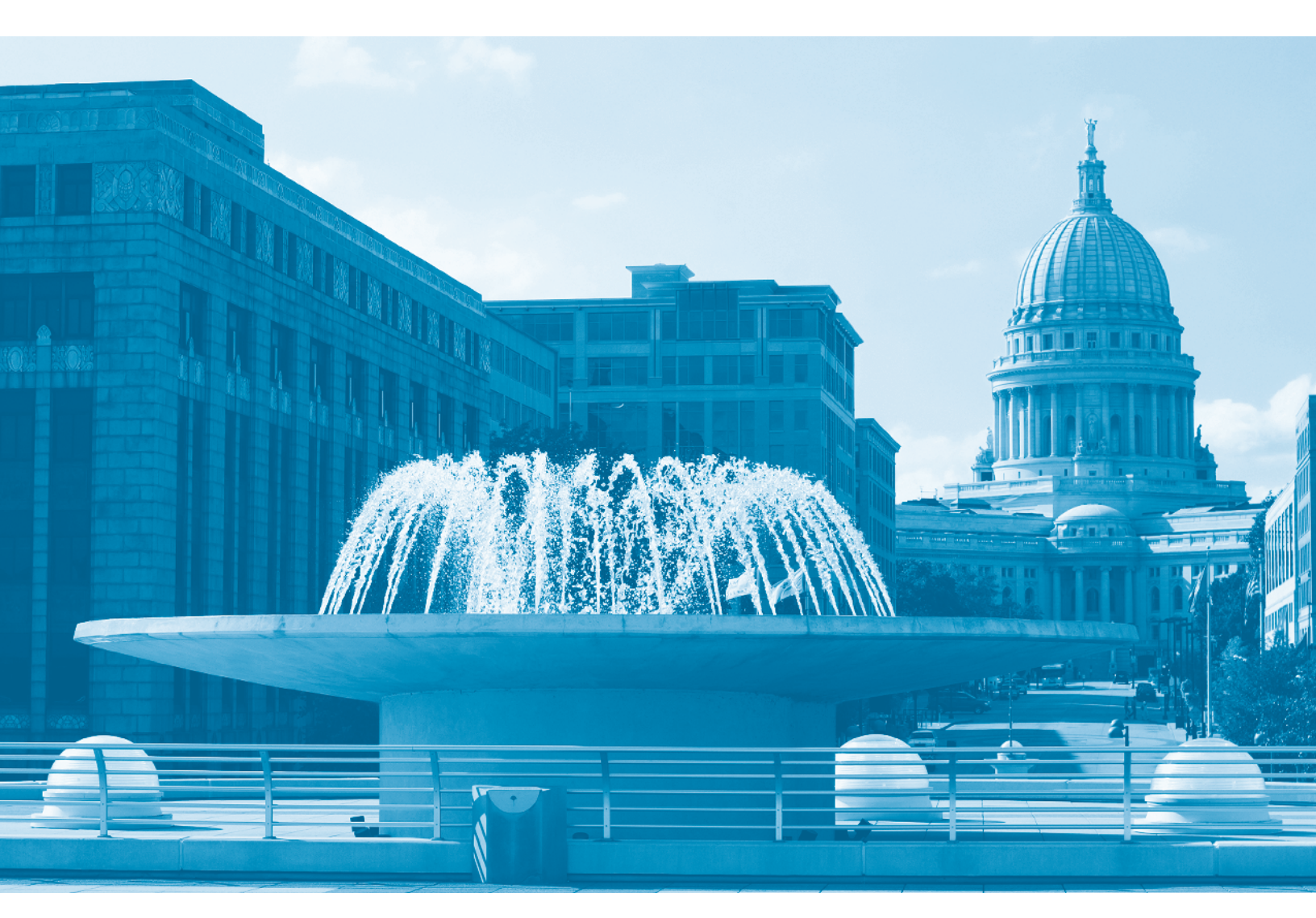
View of City of Madison.

A clearinghouse for all things solar in Madison, WI: www.cityofmadison.com/Sustainability/City/madiSUN/