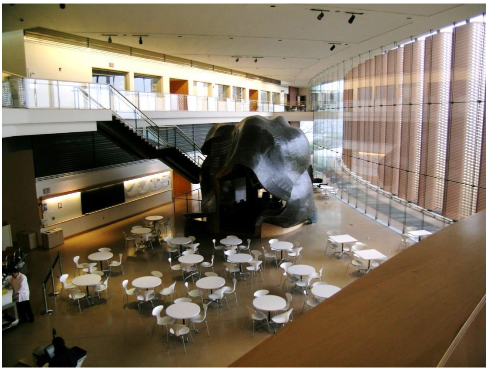
Figure 2: Two photos of the atrium space in Princeton University's Carl Icahn Laboratory, showing the two-story glass curtain wall and the external shading structures. The large sculpture was designed by Frank Gehry, and houses a conference room. The interior walls form the boundary for the laboratory wings, and were originally illuminated with linear fluorescent cove lighting. The fluorescent lamps in these luminaires were replaced with LED retrofit kits.

Most of the original lighting in the laboratory and office spaces consisted of recessed 2x2 fluorescent troffers, with supplemental linear fluorescent cove lighting in perimeter areas and a relatively small number of recessed 2x4 fluorescent troffers. Of the 564,000 kWh of energy used annually for lighting in the facility, about 43% was from the 2x2 fixtures and 30% from the 4' linear lamp fixtures. Figure 3 shows a typical lab space, with the