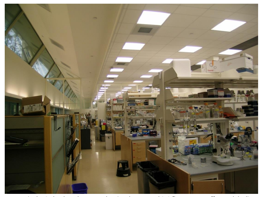
Figure 3: Laboratory space in the Carl Icahn Laboratory, showing the recessed 2x2 fluorescent troffers and the linear fluorescent cove fixtures along the perimeter.

recessed troffers providing most of the lighting in the open lab bench areas and the linear fluorescent cove luminaires used along the perimeter. The third largest lighting energy use came from recessed and surface-mounted downlights using compact fluorescent lamps (CFLs); these luminaires were used in lobby and corridor areas and accounted for about 18% of the lighting energy used in the facility.