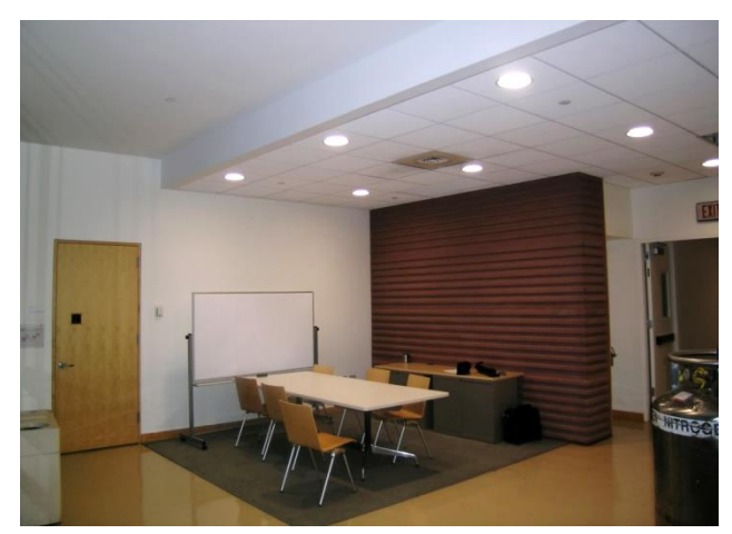
Figure 6: Conference area 200 COR, showing the downlights that were converted from CFL to LED.