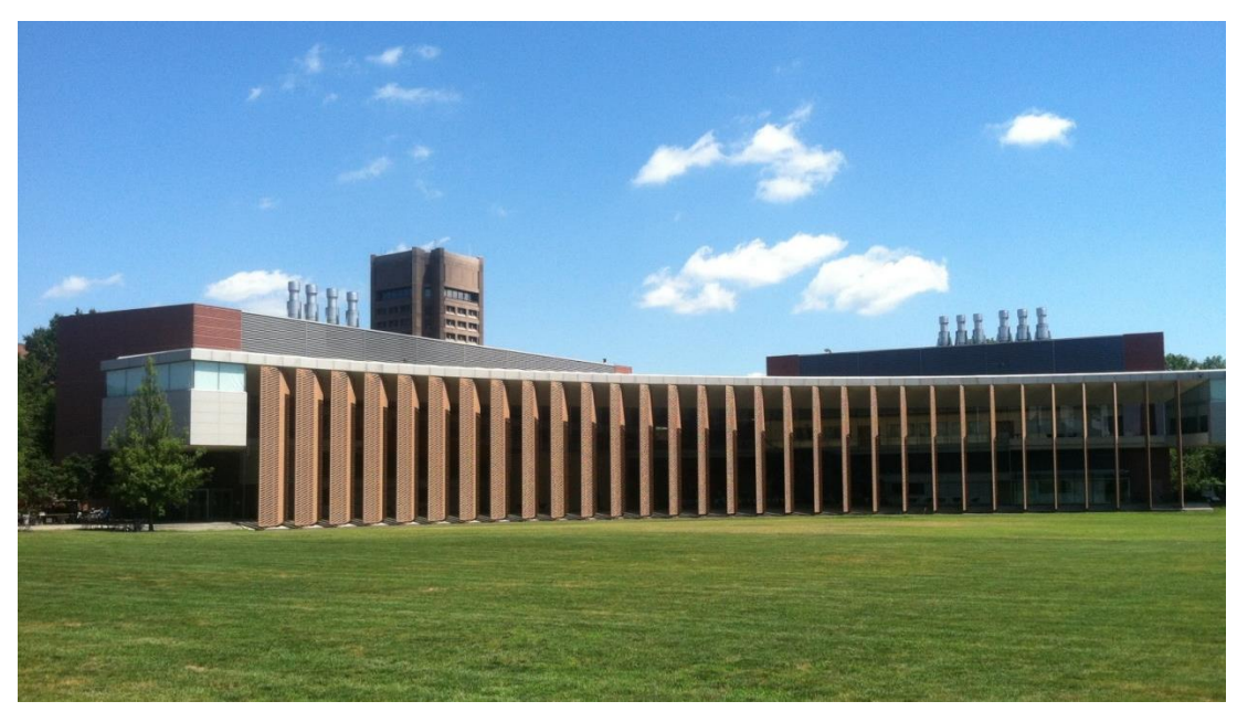
Figure 1: The Carl Icahn Laboratory at Princeton University. The external shade structures are shown at the front of the photo; these devices automatically track the sun to provide shading for the two-story atrium. The two laboratory wings extend above the atrium roof line, one on the north (left side of the photo) and one on the east (right side of the photo).

While the University has implemented many exterior lighting projects and a few smaller interior projects, <sup>4</sup> the Carl Icahn Laboratory of the Lewis-Sigler Institute for Integrative Genomics is the first building-wide interior LED project. The Carl Icahn Laboratory is a 98,000 square foot facility, with two separate three-story wings (a basement level plus two above-ground levels) that are connected by a curving, two-story atrium space. The building was designed by Rafael Viñoly and completed in January 2003. The curving two-story glass atrium curtain wall is shielded by 31 external vertical louvers, each 40 feet tall, that automatically rotate with the sun to maximize shade, minimize thermal loading, and reduce cooling load. The computer-controlled aluminum louvers are patterned to project a double-helix DNA-style shadow onto the atrium floor as a dynamic interplay of light and shadow. Figure 1 and Figure 2 show the primary architectural features of the facility.