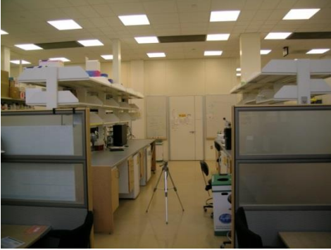
Figure 5: Room 222 (left), Corridor 233 (center), and Lab Area 110 (right).