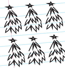
30 million retired Christmas trees

Ultimately, you are going to share facts and data that tell a story. Outline the story, and draw a sketch for each key point.