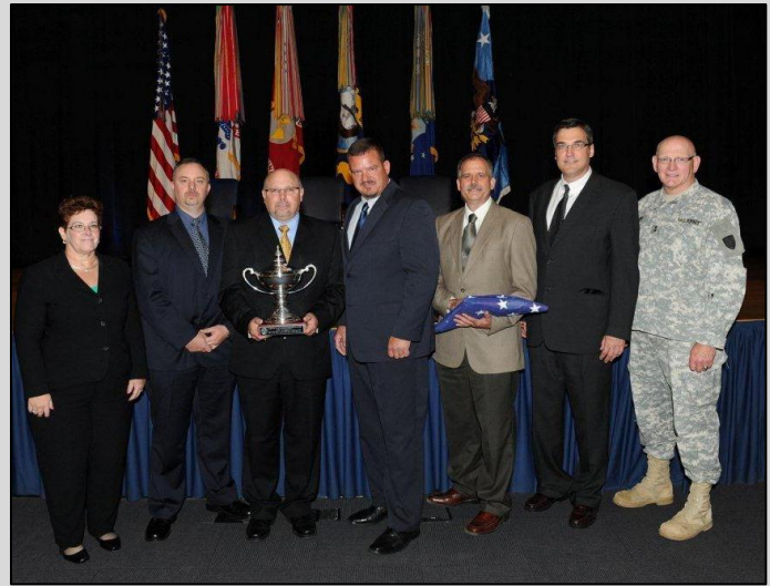
Personnel from General Dynamics and the Scranton Army Ammunition Plant receive 2012 Secretary of Defense Environmental Excellence Award.

Before developing the EnMS and energy action plans, GD found it extremely helpful to scrutinize the plant at the process level. This baseline effort enabled the staff to key in on the most promising opportunities.