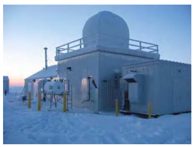
A Comprehensive Test Ban Treaty Organisation Radionuclide monitoring station

5.17 Opened for signatures in 1996 the CTBT seeks a global ban of nuclear weapons test explosions in order to limit a state's capacity to develop nuclear weapons. The UK and France were the first two nations to sign and ratify this treaty; however it will only enter into force when ratified by the remaining nine so-called 'Annex 2' states, namely: China, Egypt, India, Indonesia, Iran, Israel, North Korea, Pakistan and the US. Three of these are non-signatories of the NPT. The CTBT, and other treaties like the Fissile Material Cut-Off Treaty (FMCT), provide unique opportunities to engage these states, and bring them closer to global nonproliferation and disarmament efforts.