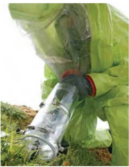
A soldier, of the Joint Nuclear, Biological & Chemical Regiment, taking an air sample from a contamination site during a simulated training exercise