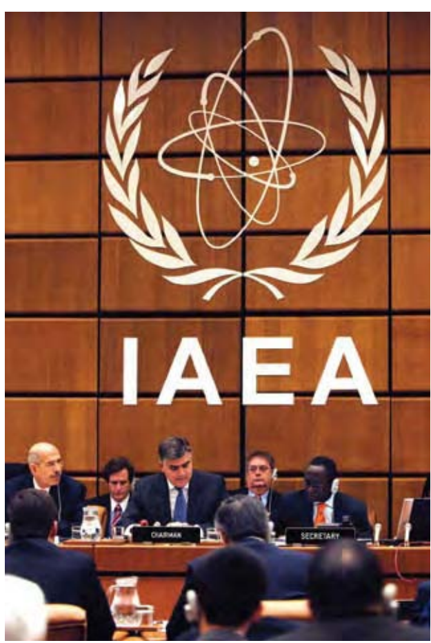
A scene from the regular session of the IAEA Board of Governors meeting in Vienna, Austria.

6.1 The nuclear question in the twenty first century is a global one. Each of the three main subjects in this paper: access to civil nuclear power, nuclear material security, and non-proliferation and disarmament, raises significant questions about the role and nature of international efforts to address the challenges.