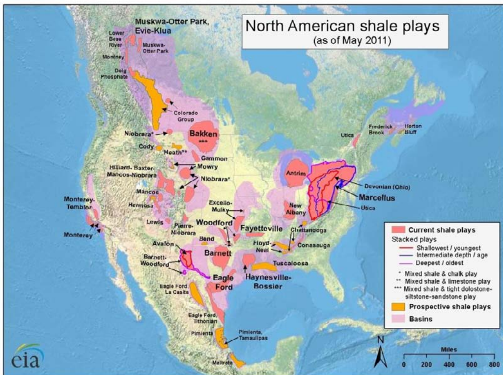
Source: U.S. Energy Information Administration based on data from various published studies. Canada and Mexico plays from ARI. Updated: May 9, 2011

Domestic production of shale gas also has the potential over time to reduce dependence on imported oil for the United States. International shale gas production will increase the diversity of supply for other nations. Both these developments offer important national security benefits. 2